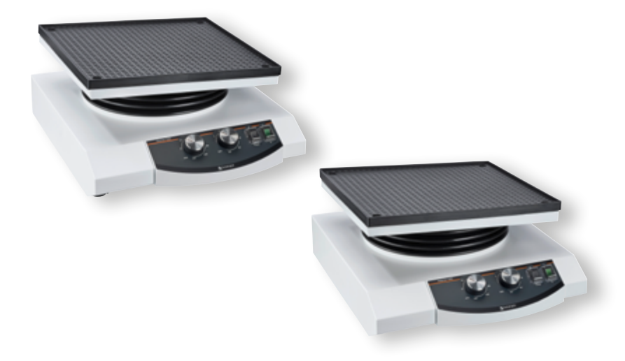
Fig. 4: Examples of a 2D and 3D shaker: Duomax 1030 (rocking platform shaker) and Polymax 1040 (platform wave shaker) by Heidolph Instruments

Platform wave shakers are particularly useful when cell cultures have to be moved gently. This is to ensure that the cells are not stressed, and are nonetheless flushed by medium. This way the cells are supplied with important nutrients.