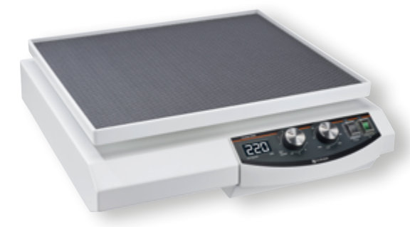
Fig. 3: Example of a reciprocating shaker: Promax 2020 by Heidolph Instruments

Due to their type of movement, reciprocating platform shakers are suitable for all types of extractions, e.g. Babcock analysis or for the determination of pesticide residues. Particularly where an increased number of samples have to be handled during a liquid-liquid extraction or in case of poor phase separation, used with suitable holding clamps for separatory funnels, the workflow can be facilitated.