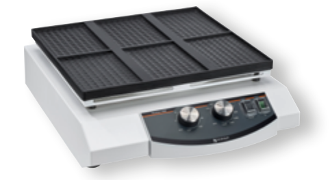
Fig. 2: Example of a vibration shaker for multi-well plates: Titramax 1000 by Heidolph Instruments

Since, with these devices, the vortex can also be generated in the small cavities of multi-well plates, a vibrating platform shaker is suitable for the washing steps in enzyme-linked immuno assays. Here, the force of the shaker is used to completely remove antibodies/antigens from loosely bonded probes and to avoid false signals in the subsequent analysis.