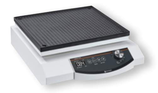
Fig. 1: Example of an orbital shaker: Unimax 1010 by Heidolph Instruments

Several models can be integrated into an incubator system, which allows particularly flexible working.