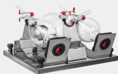
Separatory funnel attachment