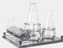
Attachment for test tubes, Falcon tubes, and Eppis