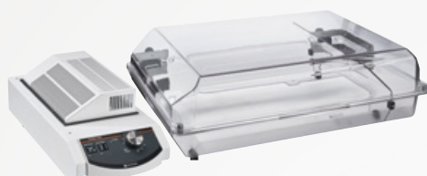
Modular incubator system 1000