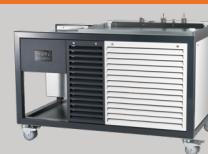
Base Cart Chiller 5000