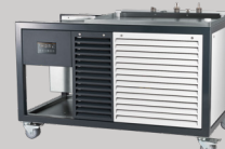
Base Cart Chiller 5000